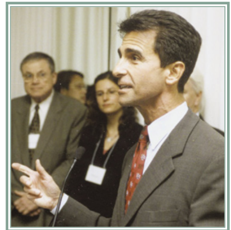
Assemblyman Mark Leno speaks at a Proposition 63 reception

Proposition 63 will fund community mental health programs with voluntary outreach, access to medicines, and a variety of support services for children and adults who suffer from disabling mental illnesses. The investment will produce hundreds of millions of dollars in savings by reducing hospitalizations and incarcerations. In pilot projects similar to those that would be funded by Proposition 63, participants had a 56 percent reduction in hospital stays, a 72 percent reduction in jail stays and a 65 percent increase in full-time jobs.